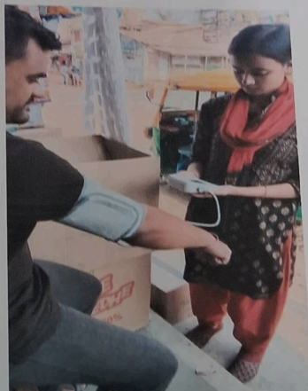
Plate 1: Different activities during survey of Farmer and Grocery Shopper male of Kshetrapal and Bhupatinagar-II Block area