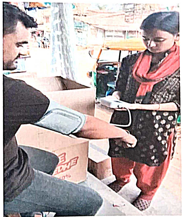
Plate 1: Different activities during survey of Farmer and Grocery Shopper male of Kshetrapal and Bhupatinagar-II Block area